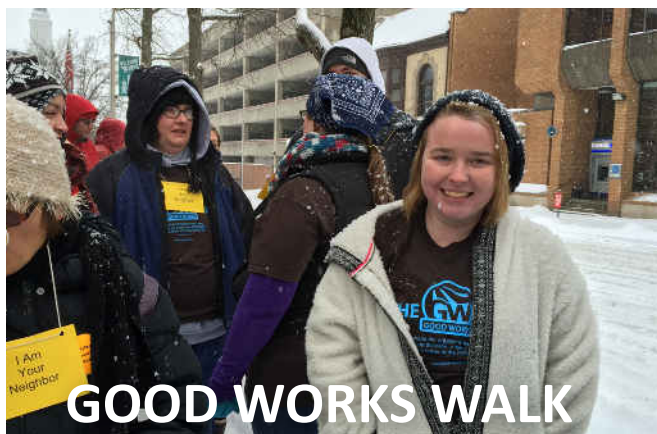
GOOD WORKS WALK

At this inspirational event, participants of all ages learn about the struggles faced by people without homes and raise support for the Timothy House. To learn about our upcoming WALK, please visit: www.goodworkswalk.net