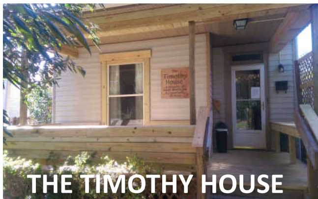
THE TIMOTHY HOUSE

For 35 years, we have provided a home for people without homes in 9 Southeastern Ohio counties. We provide 3,500 to 5,000 nights of shelter, as well as food and compassionate care for men, women, and families with children experiencing homelessness each year.