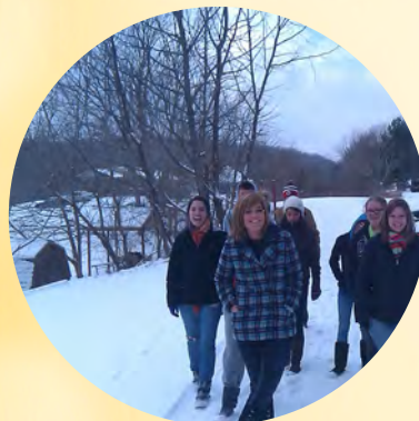
Service Living Connecting Ohio University students with the people, history, beauty, values and needs of the greater Athens area through service-based friendships.