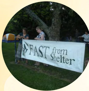
Fast From Shelter A weekend of solidarity with our neighbors experiencing homelessness to explore biblical perspectives on community, service and justice.