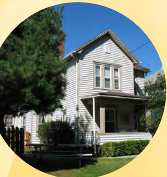
The Timothy House We provide the only shelter for men, women and children without homes in 9 rural counties in South- east Ohio.

I offer you my sincerest thanks for your continued generosity— of your gifts and yourselves! May these pictures come alive to you, expressing something of the real-life FAITH and HOPE that exists inside us as we care for people who are vulnerable.