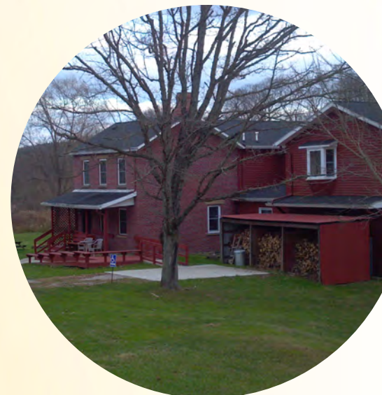
The Hannah House A home where staff, interns, and residents transitioning from home- lessness live and learn together!