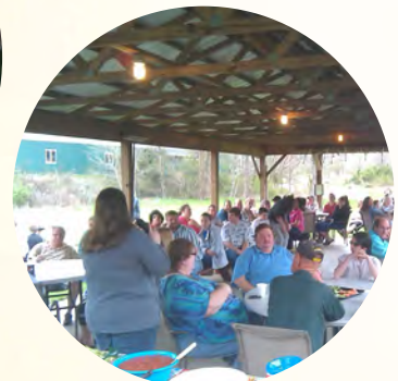
Friday Night Life Our weekly community meal offering food, companionship and spiritual nurture to people from all walks of life since 1993.