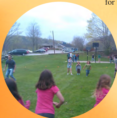
Friday Night Life Kids' Club Investing in the lives of children and teens, some of whom experience the risks of poverty. A team of staff and volunteers lead fun and educational activities every Friday night!