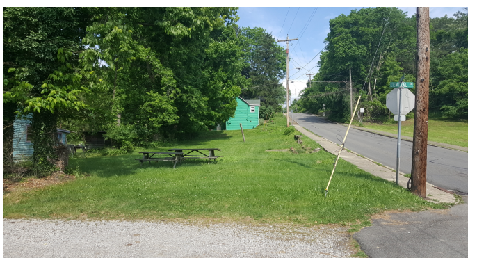
This is the future site of Sign of Hope