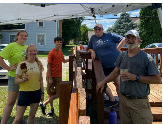
All of our 8 interns worked together to assist with different Good Works projects all summer